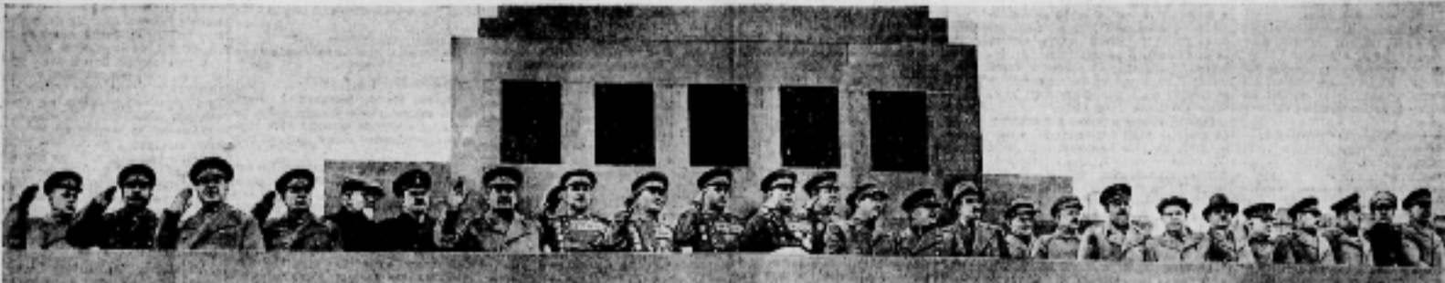
Screen shot from UDB-Pravda Digital Archive

Советский народ славит воинов доблестной Красной Армии, армии-победительницы, славит творца победы великого Сталина.