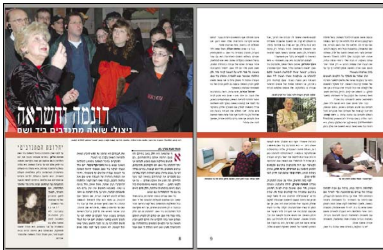
View full-text or full-image, if available.

A project of Tel-Hai College Library in Upper Galilee, where indexing was produced and then input by the University of Haifa. Newspapers captured: Ha'aretz , Hatsofeh , Al-Hamishmar , Davar , Ma'ariv , Yediot Aharonot and Hadashot (until its closing). Particular emphasis given to longer, analytical articles on social, economic, and political topics (including "op-ed" articles) as well as significant reviews of books, exhibitions, theater, and other cultural events. THIHN contains 188,500 newspaper articles from January 1985 to April 1992, and from April 1994 to February 1997.