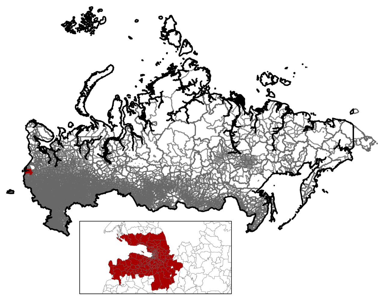
ADM 3/2/0 boundaries for all of Russia; inset detail over St. Petersburg with area in red available as sample data