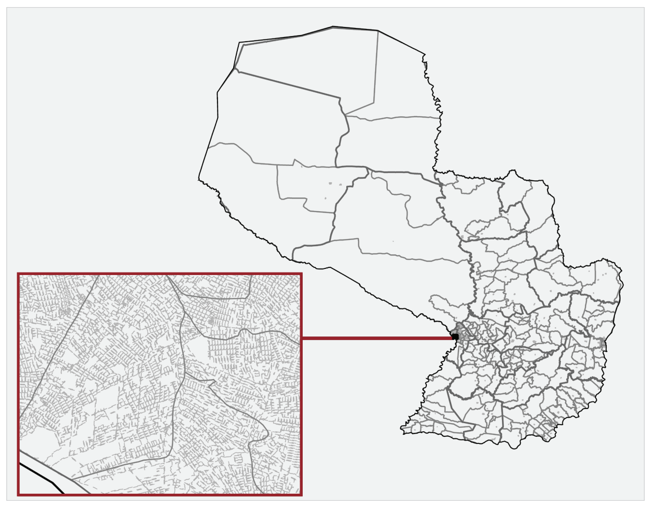
ADM 5/2/0 boundaries for all of Paraguay; inset detail over Asunción with area over Luque available as sample data