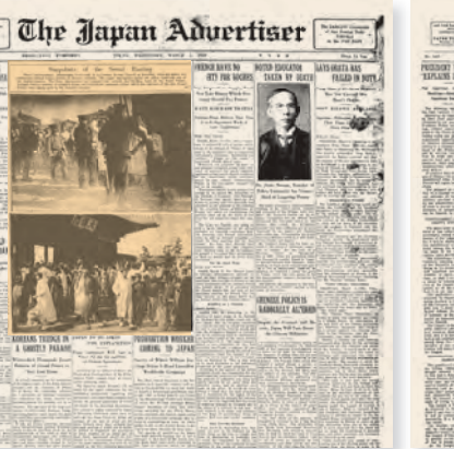
March 5, 1919 (front page)