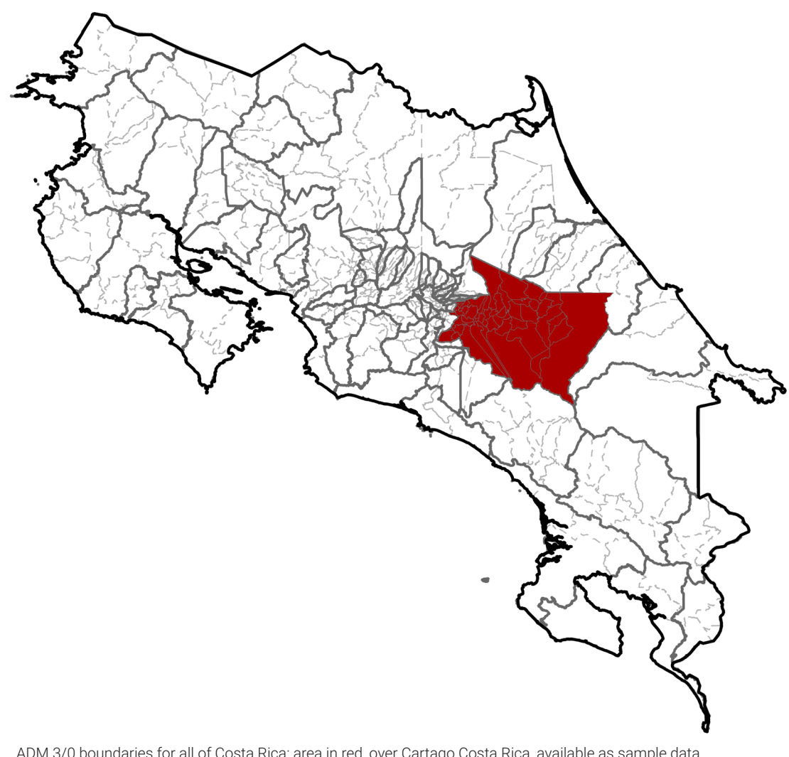
ADM 3/0 boundaries for all of Costa Rica; area in red, over Cartago Costa Rica, available as sample data