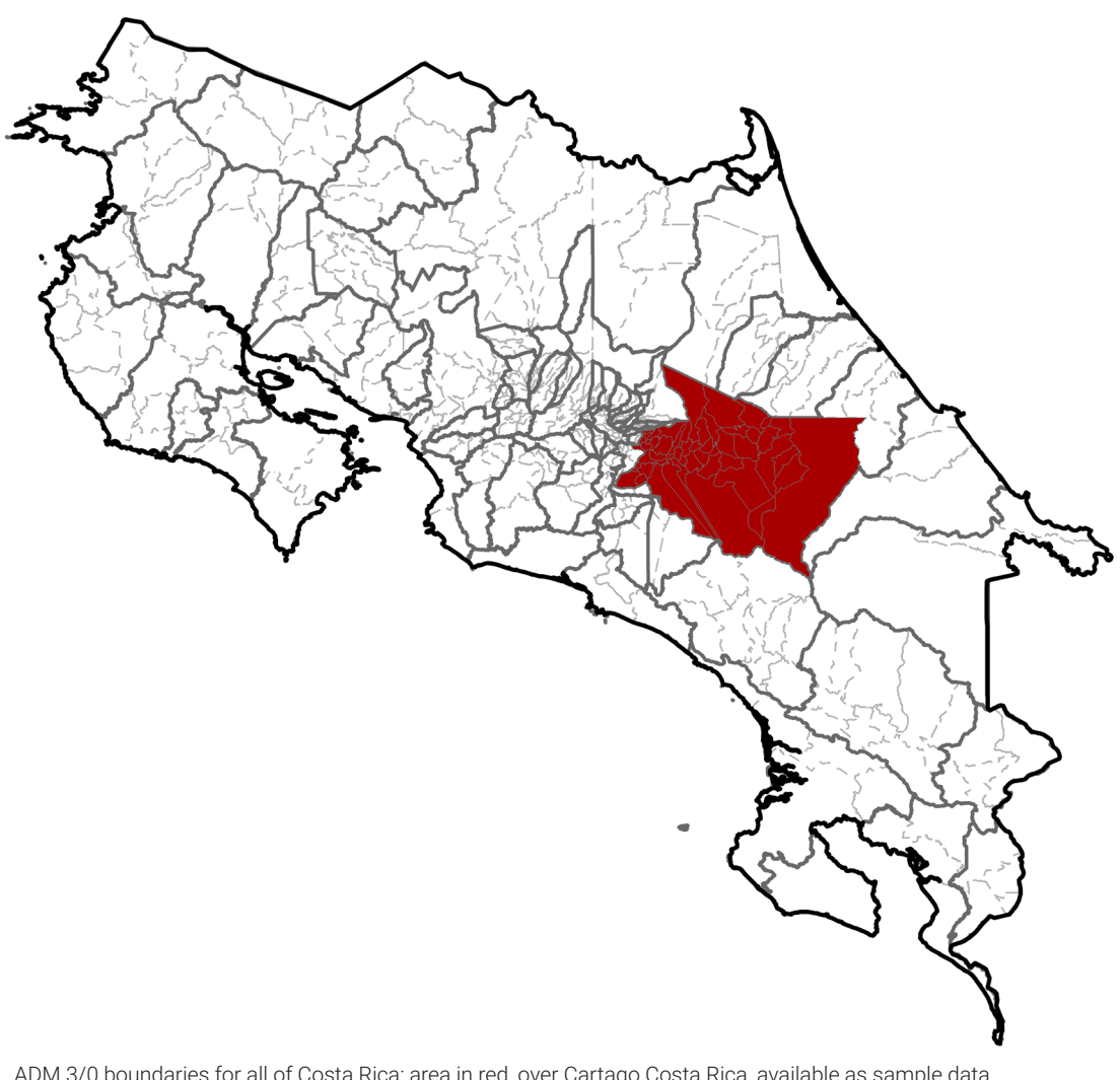
ADM 3/0 boundaries for all of Costa Rica; area in red, over Cartago Costa Rica, available as sample data