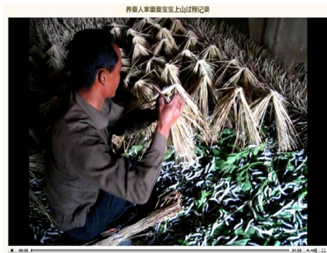
From a video on silk making in the village

Contact info@eastview.com for a trial or more information. Ask us also about SSAP's other offerings: The Scholarly Serials Database and Pishu 'whitepapers' on China.