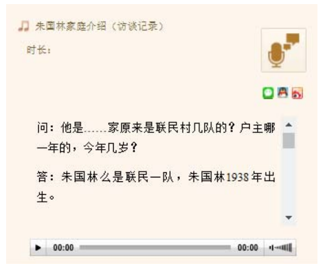
Audio files of interview with a villager