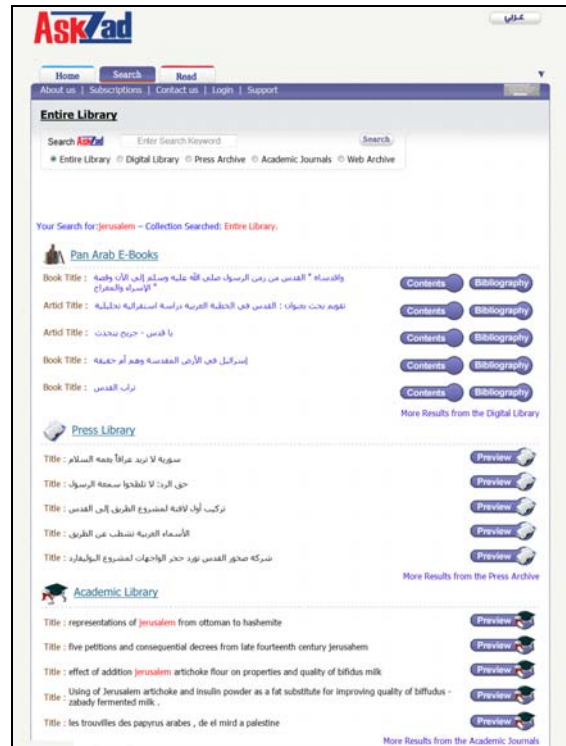
Type in a search term, in English or in Arabic, and find results in the entire database