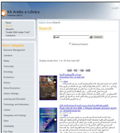
Click on the subject in English, search automatically in Arabic